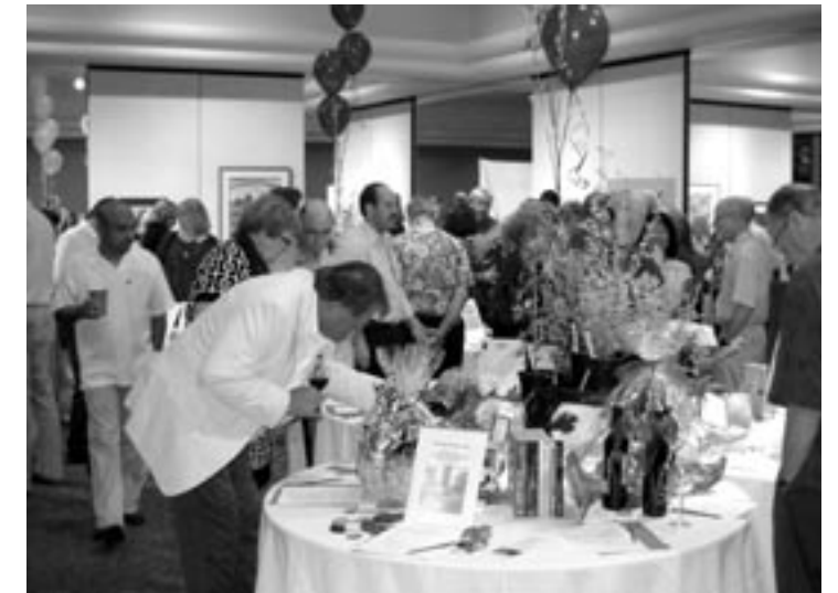
SVC supporters enjoy silent auction tables at Treasures of the Valley."

An army of volunteers (50+) made this event come together beautifully. The passion of the volunteers, assisting prior and