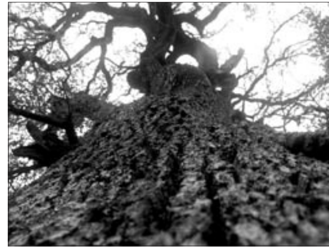
Majestic oak goes vertical at Deer Creek Hills – is $4 million at the top?

(See Elkhorn Basin Ranch - Part 3 . . . page 2)