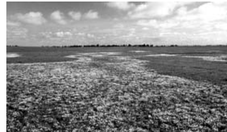
Sacramento Prairie Vernal Pool popcorn flowers in full bloom.

The project adds to the over 2000 acres of vernal pool grasslands already preserved in SVC's Sacramento Prairie Vernal Pool Area in southeast Sacramento County, just south of Highway 16, west of Sunrise Boulevard. The newly-protected 75-acre site serves as high-quality mitigation for vernal pools used for development in the Elk Grove, Laguna Ridge area.