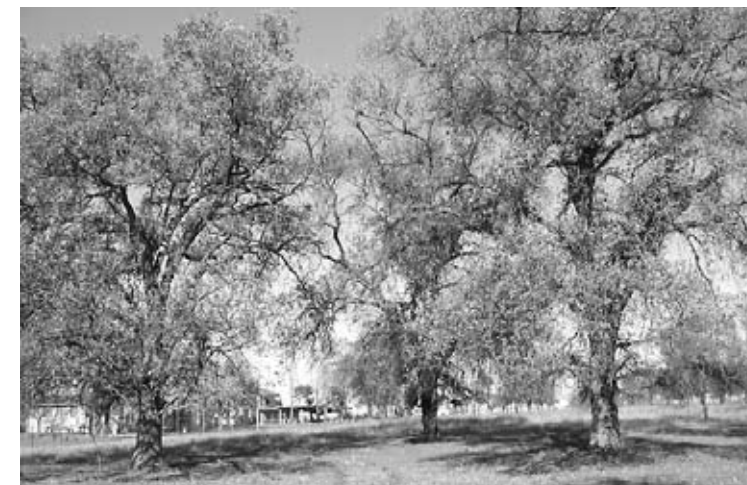
Native oaks bask in late autumn light at Isaac Ranch.

Conservation donations like the Isaac Ranch conservation easement greatly help expand SVC's conservation work in